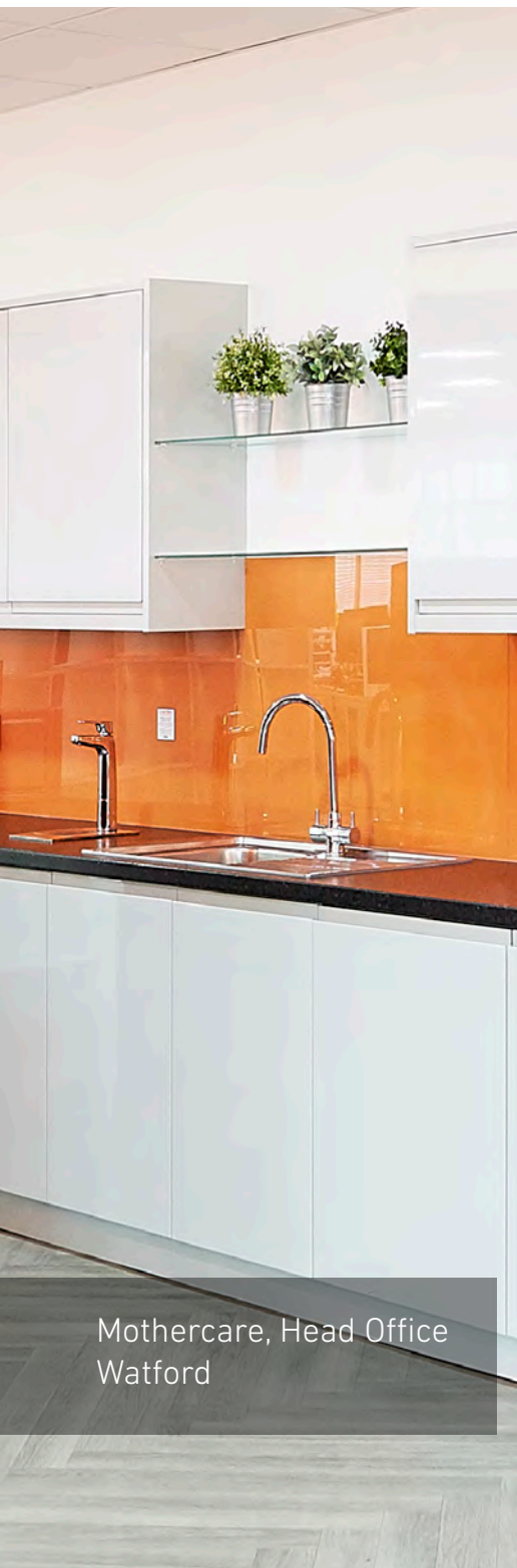
Mothercare, Head Office Watford