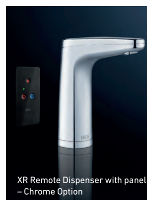
XR Remote Dispenser with panel – Chrome Option