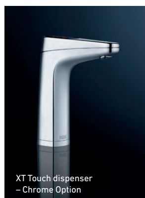
XT Touch dispenser – Chrome Option