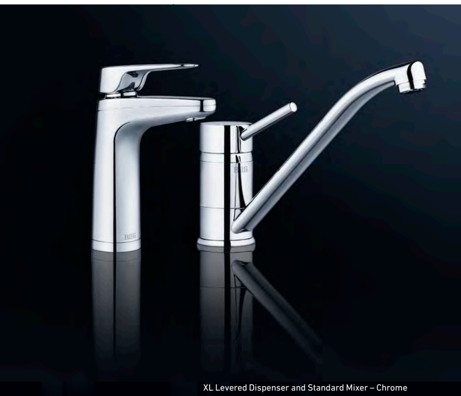
XL Levered Dispenser and Standard Mixer – Chrome