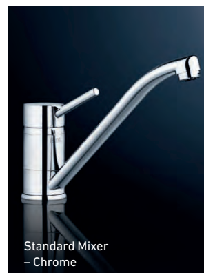
Standard Mixer – Chrome