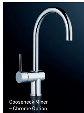
Gooseneck Mixer – Chrome Option