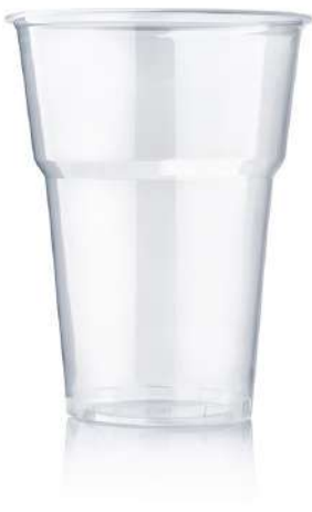
70Z CUP70ZPLA 2000