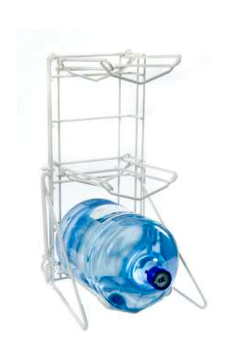
3 TIER BOTTLE RACK BOTRAC