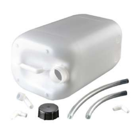
WASTE KIT WASTEKIT