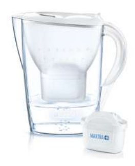
BRITA FILTER JUG + FILTER