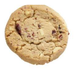
WHITE CHOCOLATE & CRANBERRY COOKIE