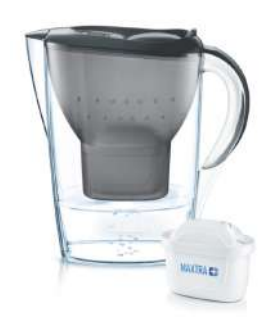
BRITA MARELLA JUG + FILTER