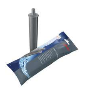
JURA CLARIS PRO SMART (LONG)