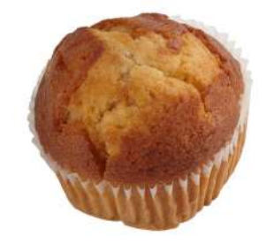
MIXED BERRY MUFFIN