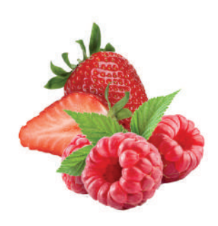
RED FRUITS 1+19