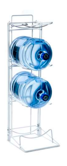
4 TIER BOTTLE RACK