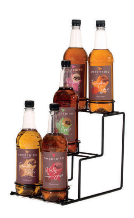
3 TIER SYRUP STAND