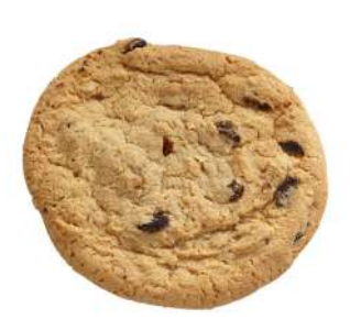
TRIPLE CHOCOLATE CHUNK COOKIE