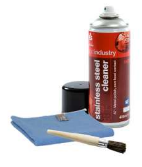
STAINLESS STEEL KIT