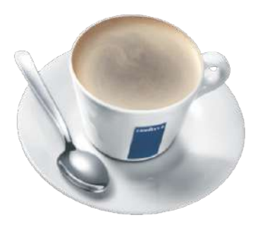
AMERICANO CUP 250ML