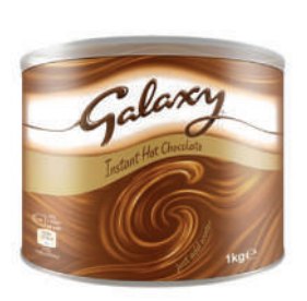
GALAXY INSTANT HOT CHOCOLATE