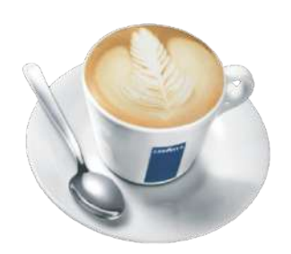
CAPPUCCINO CUP 175ML