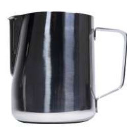
STAINLESS STEEL MILK JUG