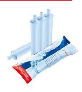
JURA CLARIS BLUE PRO (LONG)