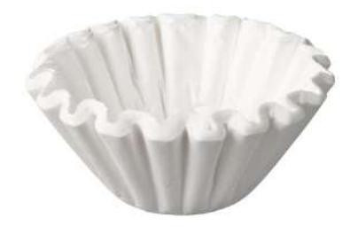
FILTRO SHUTTLE, JET6 & QUICKBREW