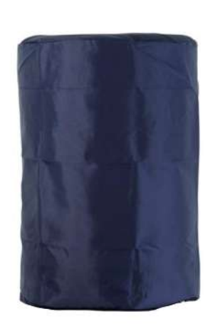
BOTTLE COVER BOTCOV