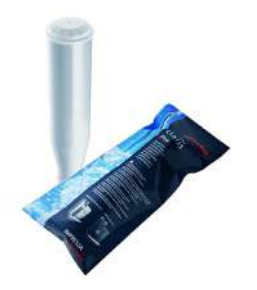
JURA CLARIS WHITE