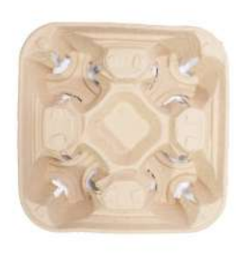
4 CUP TRAY