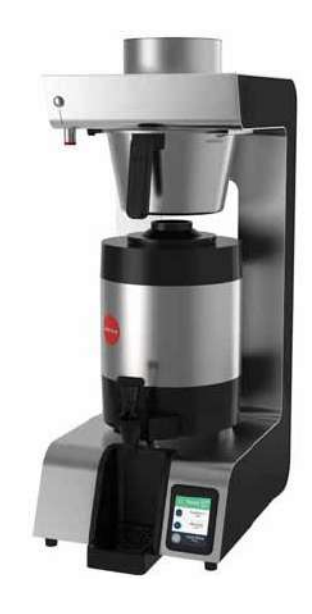
JET 6 URN JUG

We have a variety of stainless steel jugs for your catering needs. They are eco-friendly, reusable, and hassle-free.