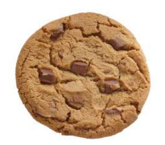
MILK CHOCOLATE CHUNK COOKIE