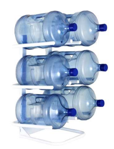
6 TIER BOTTLE RACK BOTRAC6