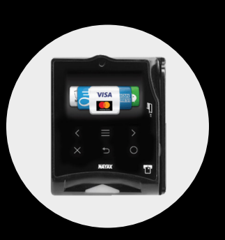
Nayax Contactless Payment System NAYAXCR-TB