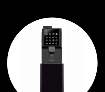
Single Base Cabinet VITROBC