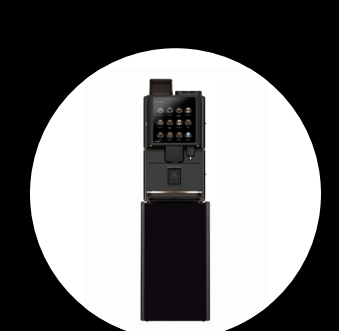
Single Base Cabinet VITROBC