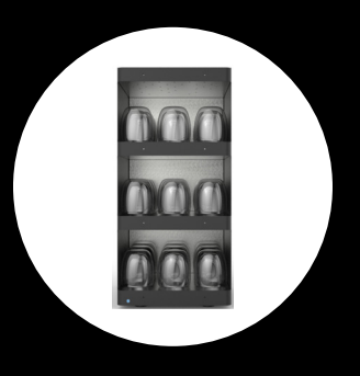
Cup Warmer VITROCWM