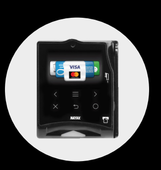
Nayax Contactless Payment System NAYAXCR-TB