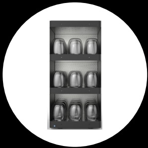
Cup Warmer VITROCWM