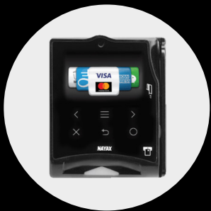
Nayax Contactless Payment System NAYAXCR-TB