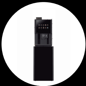
Single Base Cabinet VITROBC