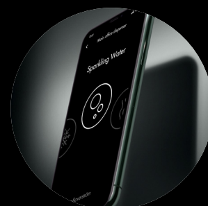
Bluetooth Touchless Dispense ZPBO-194150