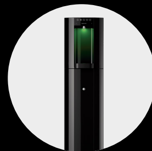
Floorstanding Base Cabinet PBOE6