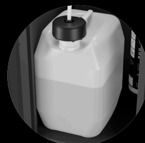
Bluetooth Alarmed Waste Kit ZPBO-720400