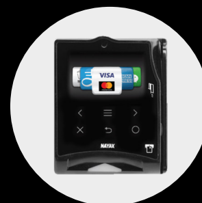
Nayax Contactless Payment System NAYAXCR-TB