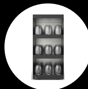
Cup Warmer VITROCWM